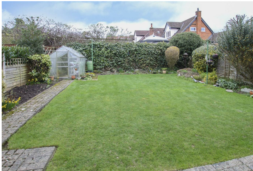
4 The Gardens, Doddinghurst, Brentwood, CM15 0LU

** ONLINE VIEWING AVAILABLE - ON REQUEST ** An individually designed three double bedroom detached house offering excellent scope for improvement and benefiting from a lounge, separate dining room, kitchen, bathroom with coloured suite and large entrance hall to the ground floor. To the first floor are three double bedrooms with an en-suite shower room to the Master bedroom. A well maintained 30' garden. UPVC double glazed windows. To the front of the property is parking for two vehicles leading to an integral garage which has a remote up and over door with power and light connected. There is also a large storage shed down one side of the property. Situated within a short walk of Doddinghurst main parade of shops and school and within close proximity to open fields. No ongoing chain.